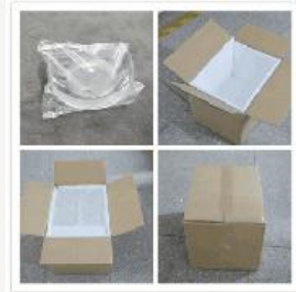
General Packaging: PE bag/ bubble bag + foam card + outer box