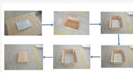
Safety Packaging: PE bag/ bubble bag + foam card + inner box + outer carton